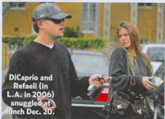
DiCaprio and Refaeli (in L.A. in 2006) snuggled at lunch Dec. 20.